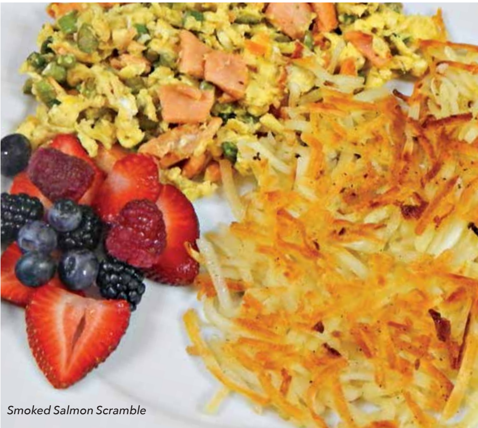
Smoked Salmon Scramble

Add bacon $5.95 | Add sausage links $3.99