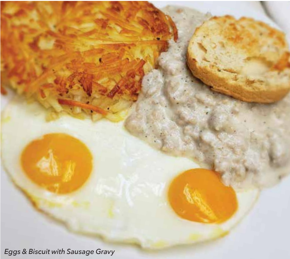
Eggs & Biscuit with Sausage Gravy

*Meats or eggs that are under cooked to your specification may increase your risk of food borne illness, especially if you have certain medical conditions.