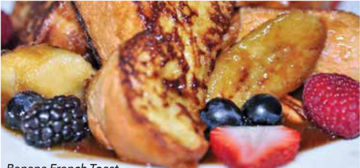
Banana French Toast