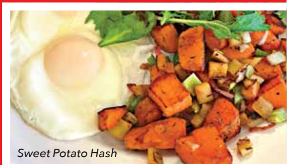
Sweet Potato Hash